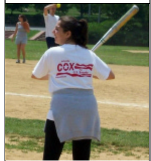
Her shirt says it all, folks!