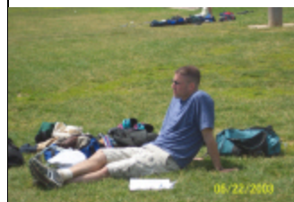
“Dreams of glory”